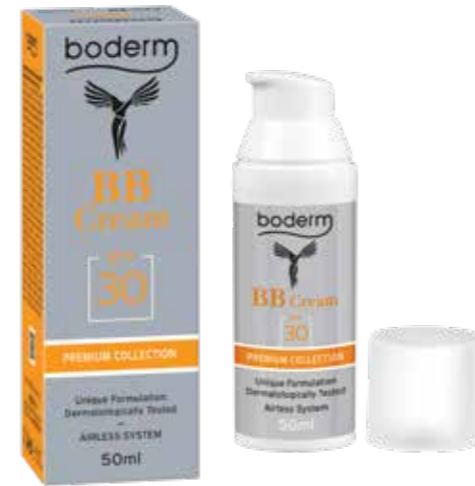
Prototype™ BB Cream SPF 30, 50ml

Sunscreen for face with coverage (colour) and SPF 30.