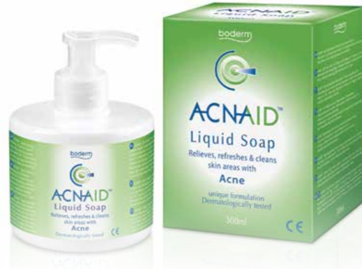
Acnaid™ Liquid Soap 300ml CE & 500ml CE

Acnaid™ Liquid Soap uses Water Lily extract that belongs to the botanical family of cosmetology.