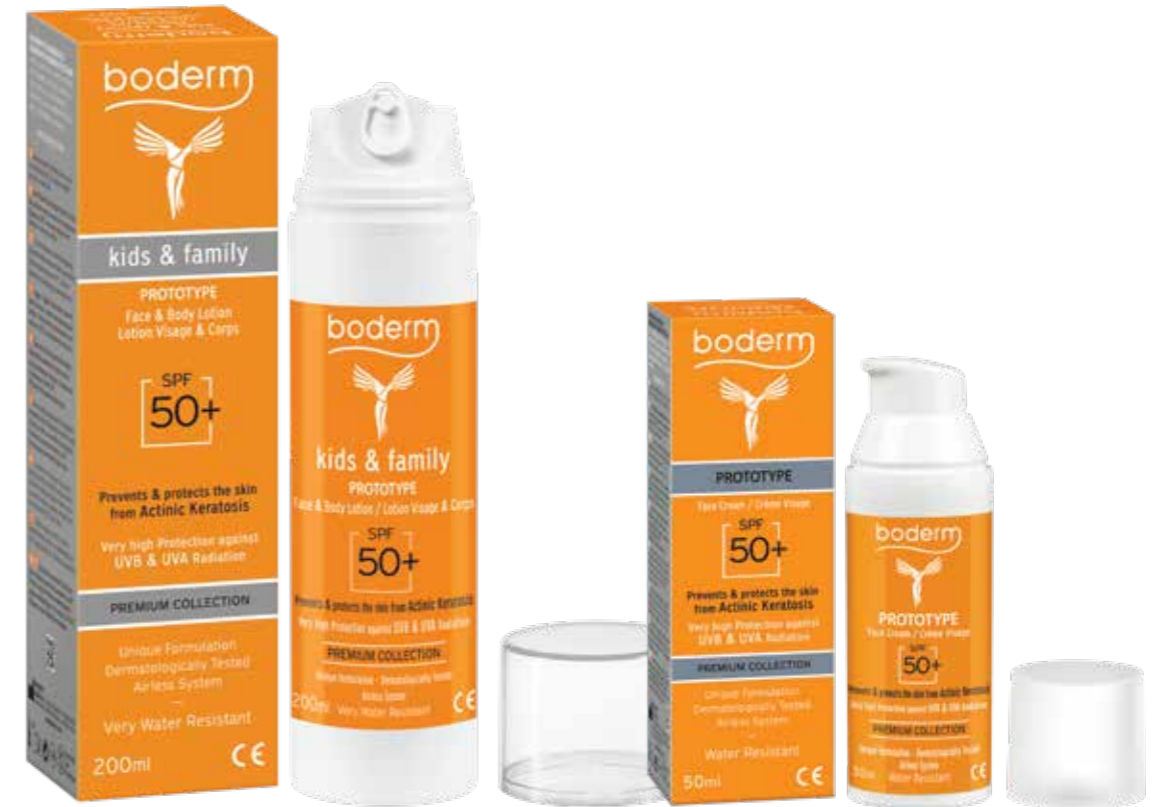
Prototype™ Face Cream 50ml CE