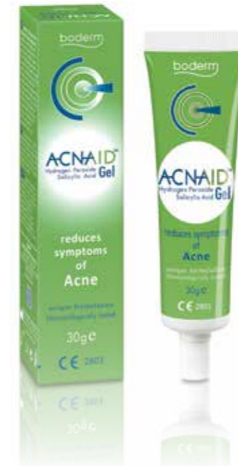
Acnaid™ Gel 30gr CE 2803