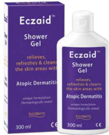
Eczaid™ Shower Gel 300ml CE

Eczaid™ Shower Gel is a soft shower gel made for body & scalp wash of dry, very sensitive, atopic skin.