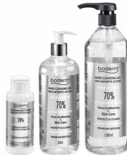
Boderm™ Hand Cleansing Gel Premium Edition

Available in Pack of 15 units and 50 units