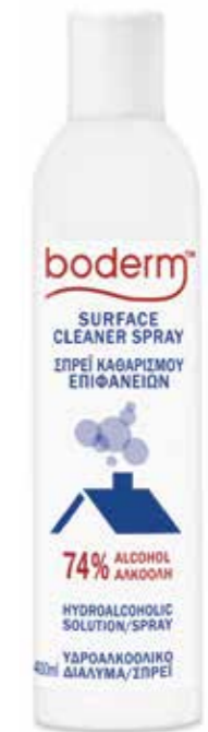
Boderm™ Surface Cleaner Spray