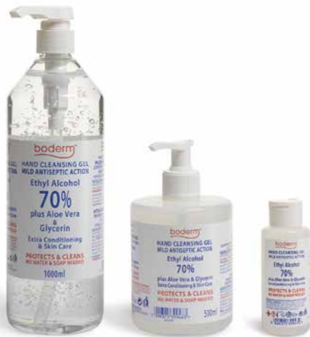
Boderm™ Hand Cleansing Gel