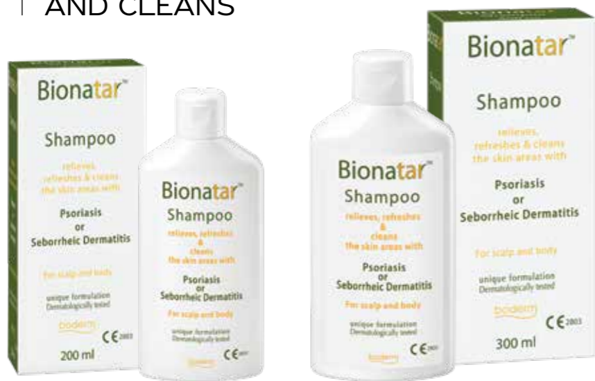
Bionatar™ Shampoo 200ml & 300ml CE 2803

Bionatar™ Shampoo developed to offer exfoliation, cleansing and soothing of the scalp and the skin in patients who develop symptoms of Psoriasis or Seborrheic Dermatitis.