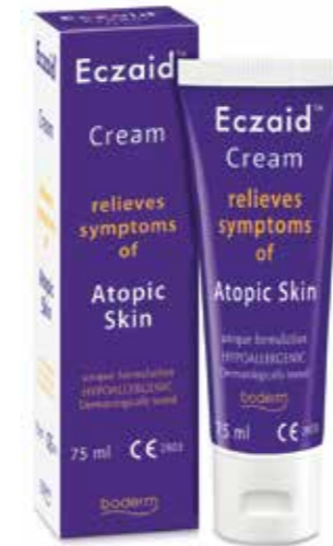
Eczaid™ Cream 75ml CE 2803

Eczaid™ Cream improves skin lipid barrier function & restores dry, sensitive, atopic skin.