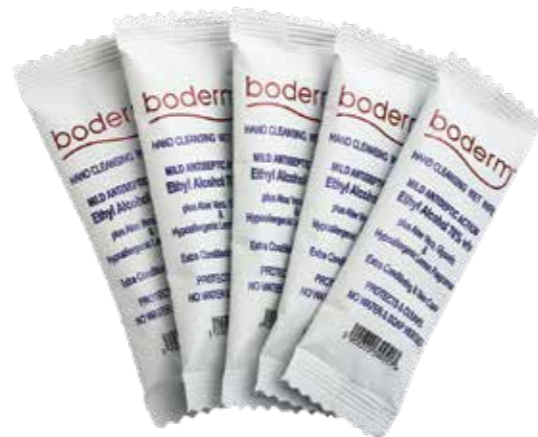
Boderm™ Hand Cleansing Wet Wipe