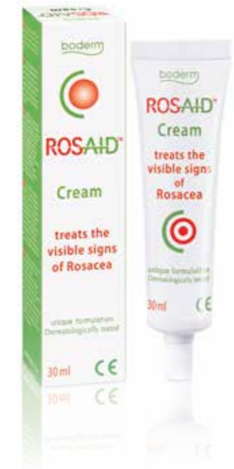
Rosaid™ Cream 30ml CE

Rosaid™ Cream is a non-invasive medical device intended to control the visible signs of rosacea. Rosacea is a skin condition that affects parts of face, such as nose, cheeks and forehead.