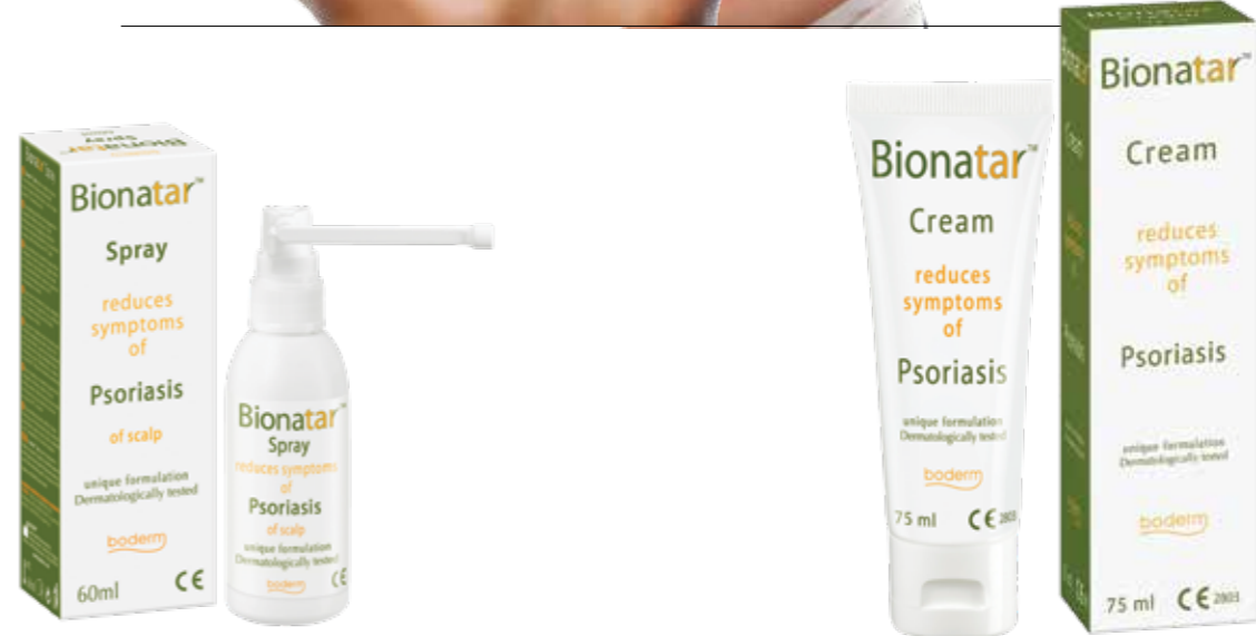
Bionatar™ Spray 60ml CE

Bionatar™ Spray reduces symptoms of Psoriasis in Scalp.